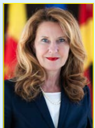
Heike Raab Chair of the CoR Commission for Social Policy, Education, Employment, Research and Culture

// It is truly encouraging that the renewed Joint Action Plan between the European Committee of the Regions and the European Commission promises not only to deepen our inter-institutional cooperation, but to also place highly relevant research and innovation priorities—such as competitiveness, health, skills development and social cohesion—firmly on the wider EU agenda."