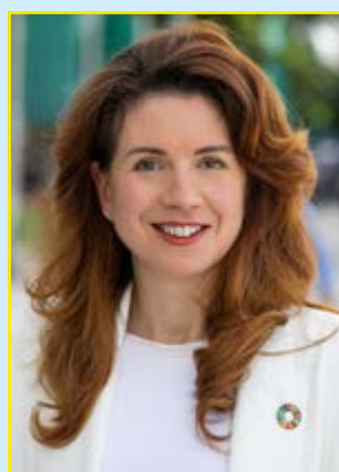
Kata Tüttö President of the European Committee of the Regions

// It is truly encouraging that the renewed Joint Action Plan between the European Committee of the Regions and the European Commission promises not only to deepen our inter-institutional cooperation, but to also place highly relevant research and innovation priorities—such as competitiveness, health, skills development and social cohesion—firmly on the wider EU agenda."