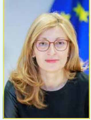
Ekaterina Zaharieva European Commissioner for Startups, Research and Innovation

// Every European policy on research and innovation must mean concrete benefits for our citizens, no matter where they are living. Through the new Joint Action Plan and together with our partners in the Committee of Regions, we will make that happen."