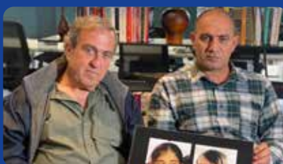
© Bassam Aramin and Rami Elhanan